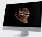
GALILEOS Implant software